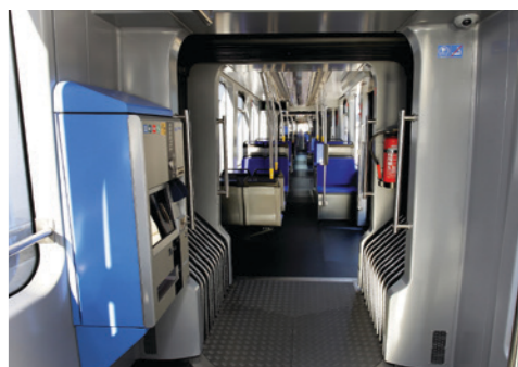
Interior with automatic ticket machine and gangway